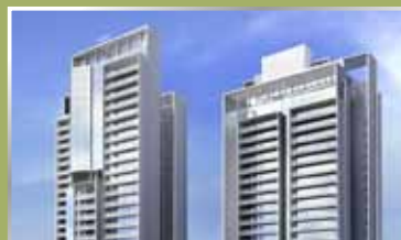
THE ARTE CONDOMINIUM