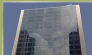
ST REGIS HOTEL